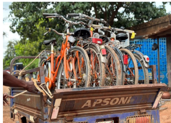
Bicycles for the women's gardens

We also wanted to equip all 7 gardens with two bicycles each so that the women could transport their products more easily. The Velafrica bicycles have now arrived in Burkina.