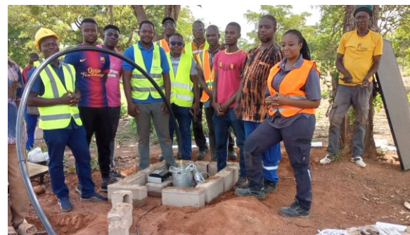
Installing the pump in Bana2

We also wanted to equip all 7 gardens with two bicycles each so that the women could transport their products more easily. The Velafrica bicycles have now arrived in Burkina.