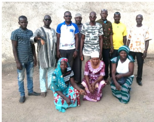
The plastic collection group