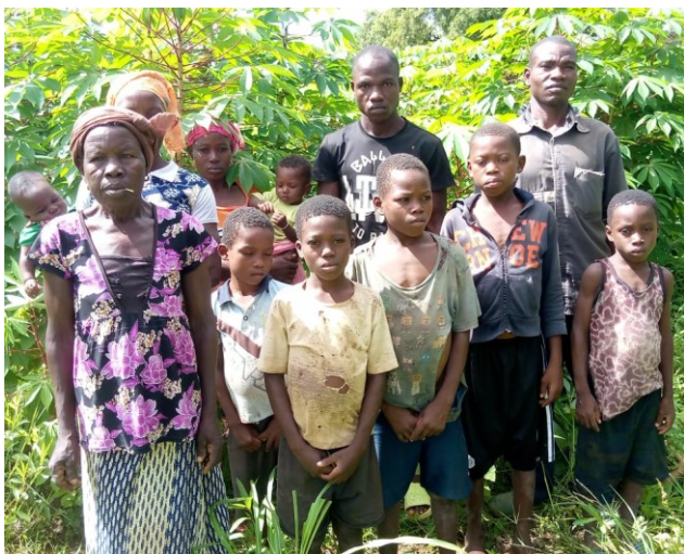
Internally displaced people in the garden of Nasso

We have one more time been affected by this: A few weeks ago, the Rebot schoolhouse and the associated guardhouse in Borodougou were attacked at night by a local gang of robbers, and the expensive batteries for the solar lighting were stolen. We have decided not to replace these until after the school holidays. (Cost 500 CHF)